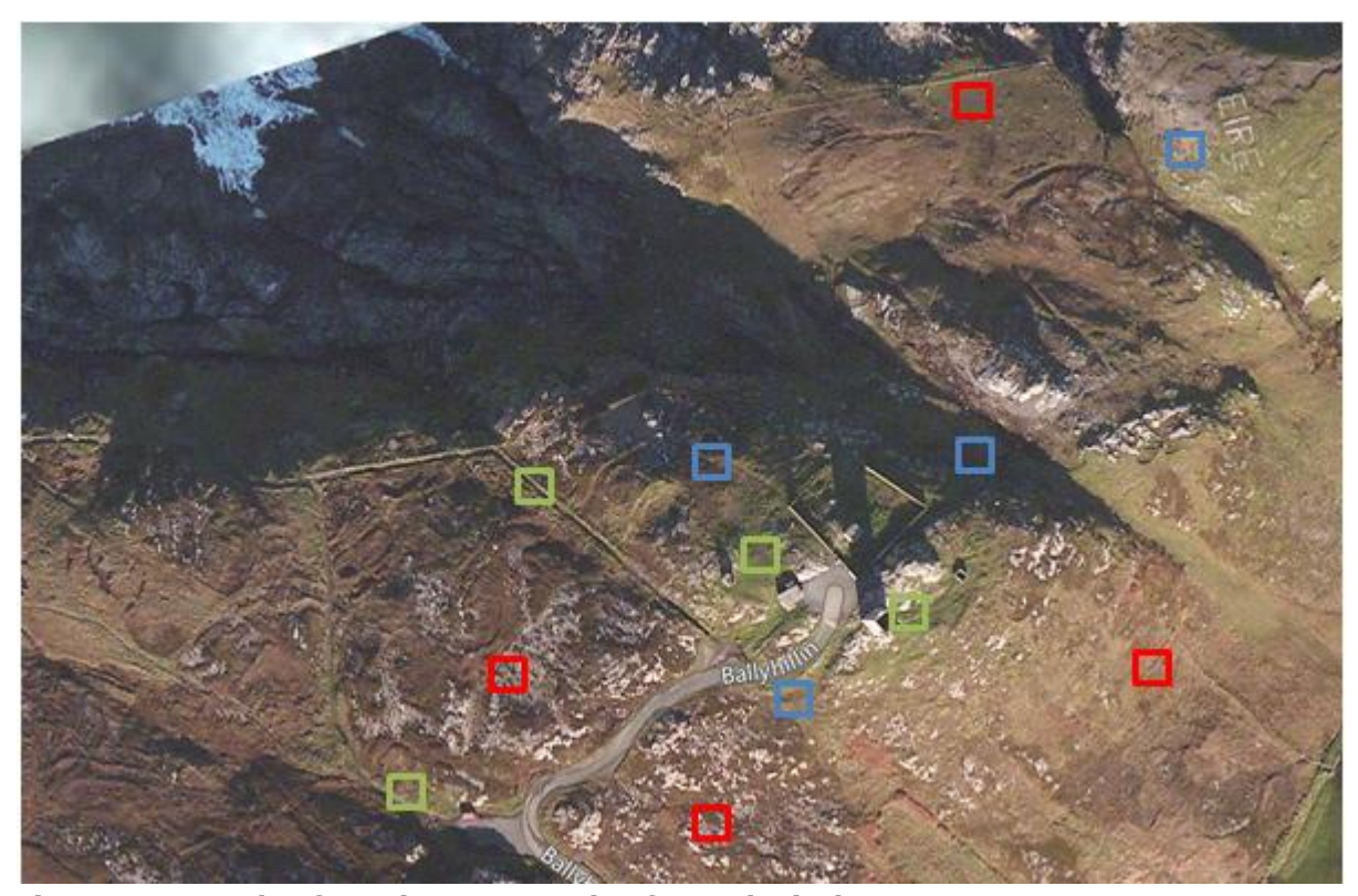
Figure 3.3 Sample of Quadrat Survey Plan for Ecological Survey

In Figure 3.3, Green and blue squares indicate Core and Secondary movement areas. The red squares are intended to be control sites as these are areas where no visitor activity was observed. The quadrats will be placed inside these squares.