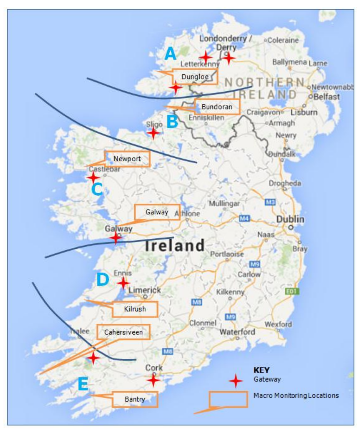
Figure 3.1 Assessment of Regional Assimilative Capacity