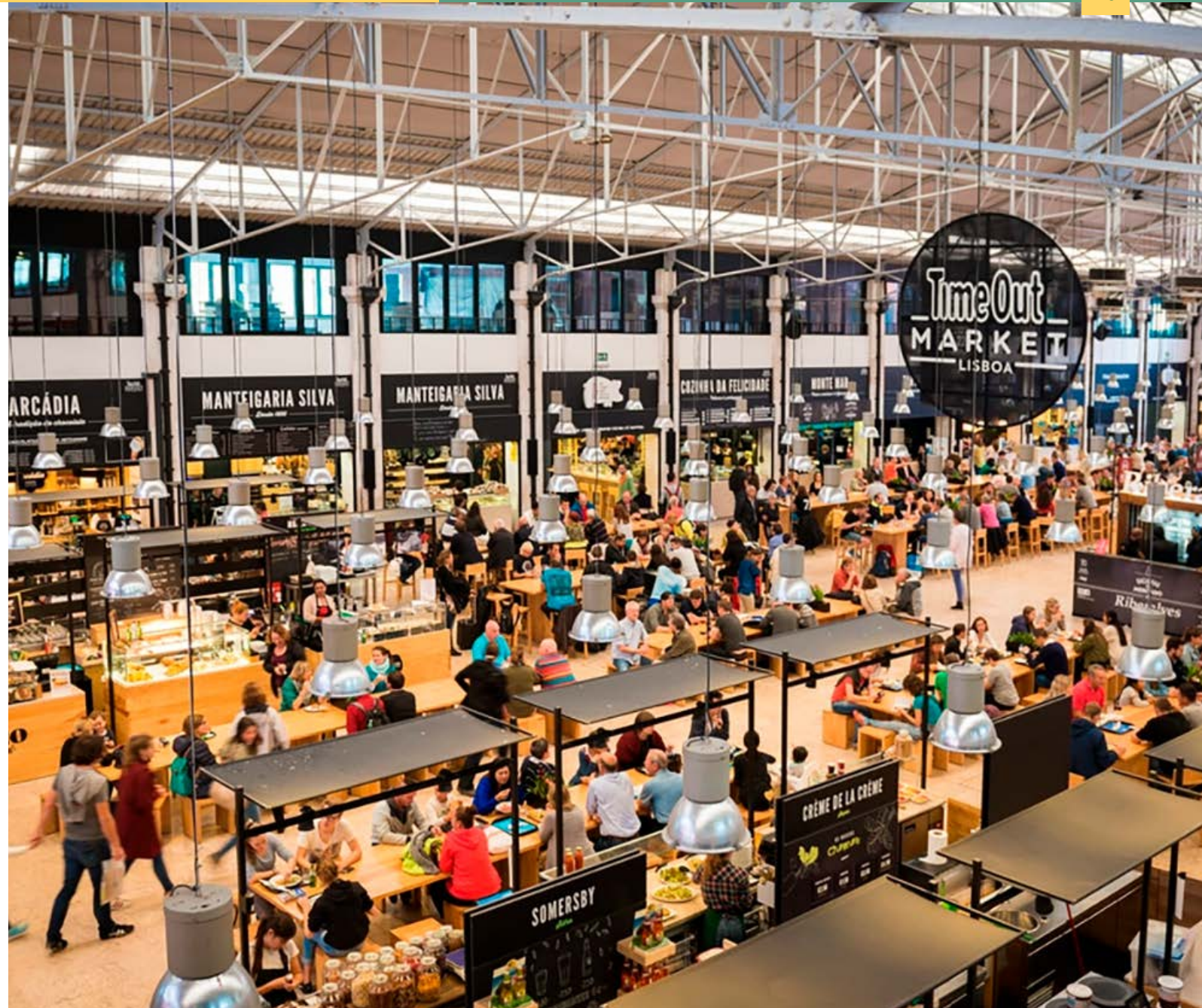
Time Out Market ( www.timeout.com )