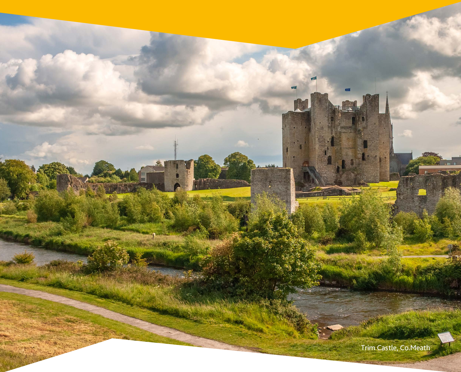
Trim Castle, Co.Meath