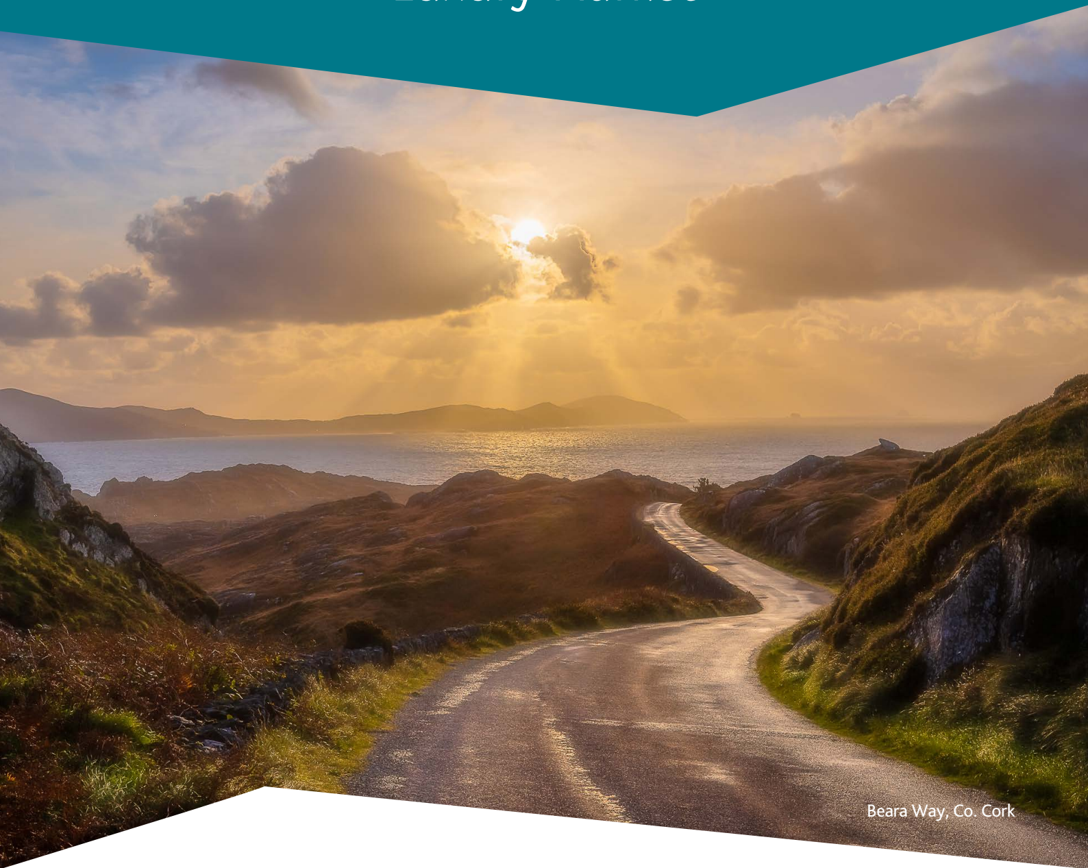
Beara Way, Co. Cork