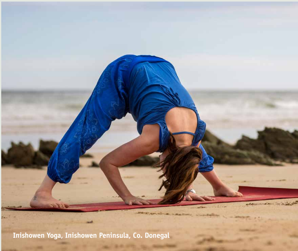
Inishowen Yoga, Inishowen Peninsula, Co. Donegal