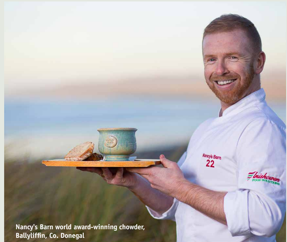
Nancy's Barn world award-winning chowder, Ballyliffin, Co. Donegal