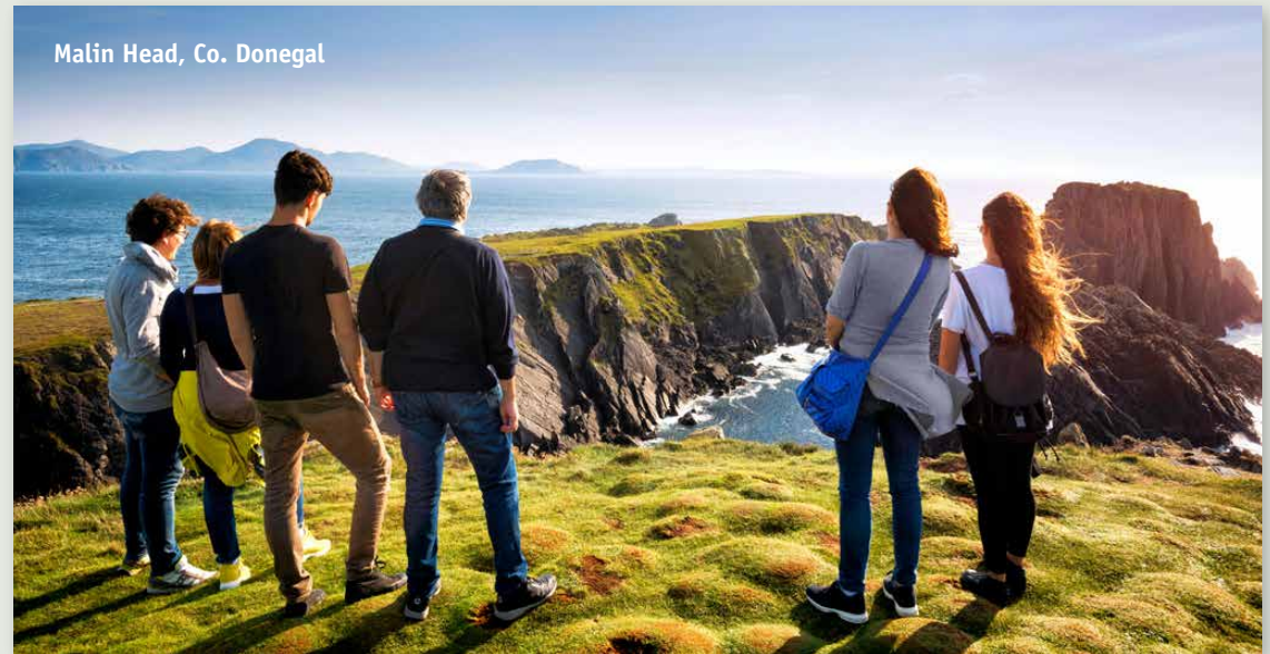
Malin Head, Co. Donegal

As Ireland's most northerly point and the first (or last) Signature Discovery Point on the Wild Atlantic Way, Malin Head has been growing in popularity as a destination. It is the focal area of many of the Inishowen Peninsula's maritime and military stories and offers an excellent land-based viewing location for marine wildlife and outstanding scenery for walking. The Malin Head Visitor Management Plan has been completed, although has yet to be fully adopted. The aim of this DEDP is to leverage Malin Head's position as the most northerly Signature Discovery Point on the Wild Atlantic Way and guide the future development of tourism for the area in a sustainable way which will deliver economic benefits to the local community.