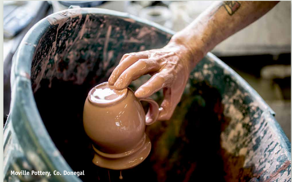
Moville Pottery, Co. Donegal

The creativity found within the Inishowen Peninsula today has a long history and remains a key hallmark of the peninsula. However, like many rural areas, it is a fragmented sector and market awareness of the collective offering is low. The concept of a creative hub is aimed at fostering growth in the local and regional creative economy. It can take on different formats and can be established for different purposes with the focus generally being on smaller providers. This strategic priority has identified two potential hubs – the Market House in Clonmany and the proposed Creative Maker’s Hub in Carndonagh. Each creative hub concept is distinctive in its own right and when taken together they add significant value to the creative sector and to tourism. Both have the potential to act as staging areas to engage the visitor further in Inishowen’s Creative Story .