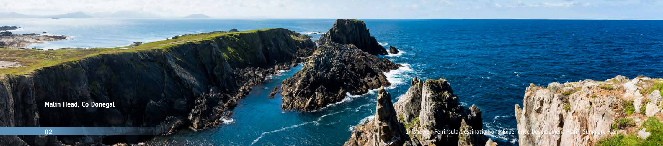
Malin Head, Co Donegal