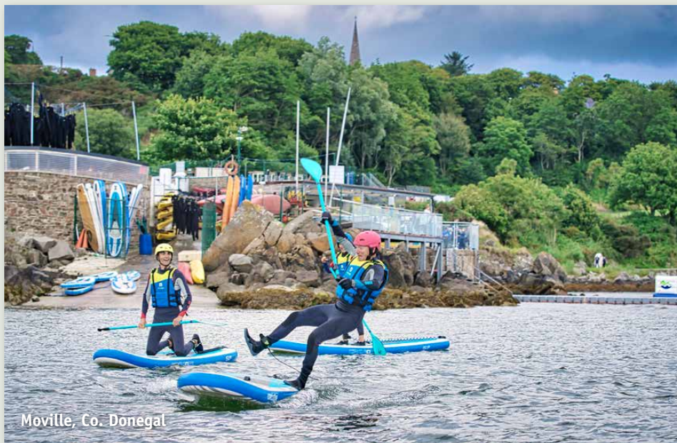
Moville, Co. Donegal