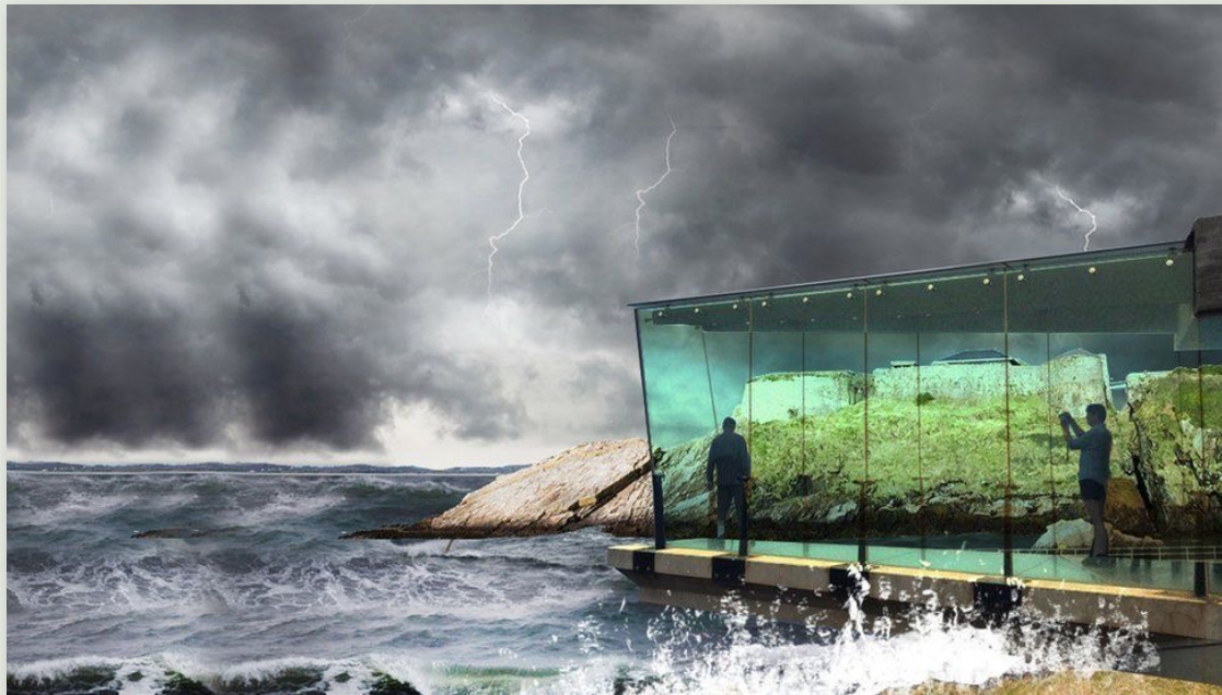
Proposed developments at Fort Dunree, Co. Donegal

one in Ireland) will offer visitors a “thrilling ascent” to the High Fort, whilst its descent will provide breath-taking views of Lough Swilly and its surroundings. A further key value proposition is the development of the glass walkway, bridging two elements of the site and providing spectacular views of the natural environment. The Fort Dunree Business Case prepared for the funding application provides an initial guiding document.