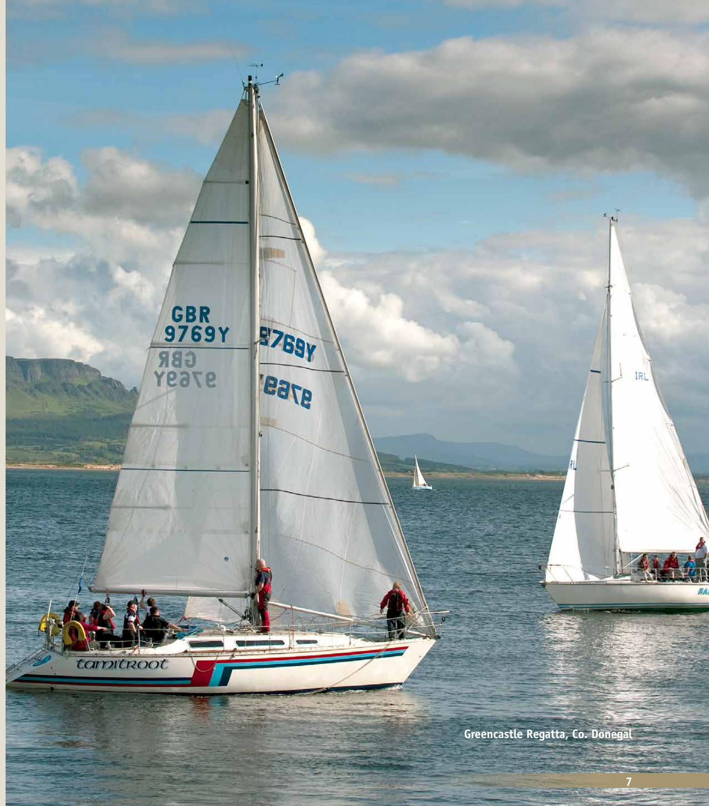
Greencastle Regatta, Co. Donegal