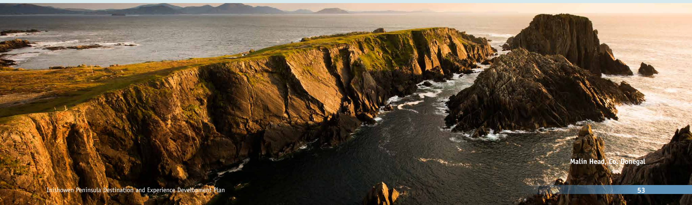
Malin Head, Co. Donegal

Reference made to projects in this DEDP does not guarantee funding, but where funding is available, it will be in alignment with this DEDP. While funding is provided to certain projects, Fáilte Ireland is not the developer. Developers are required to comply with relevant legislation and the provisions of statutory policies, strategies, plans and programmes, including those relating to environment and planning.