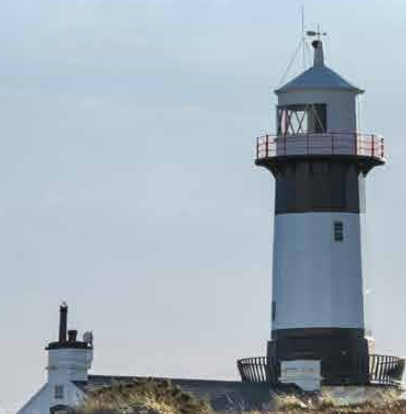
Stroove Lighthouse, Co. Donegal

Wild Atlantic Way Operational Programme 2015-2019