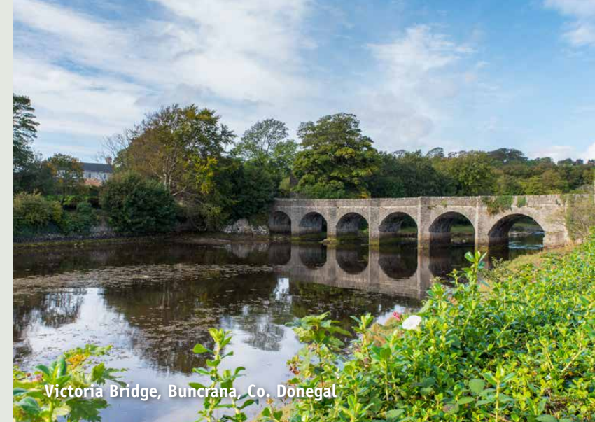
Victoria Bridge, Buncrana, Co. Donegal

Leaving the N13 on the west side of the Inishowen Peninsula takes the visitor through Burnfoot and past unusually flat land – one of the largest organic farms in Ireland is located here on land that was reclaimed from Lough Swilly at the end of the 19th Century. Inch Island lies to the west – connected by a causeway road. This island, otherwise known as Inis na nOisirí – has its name derived from ‘Island of the Oysters’. Buncrana, the historic home of the O’Doherty clan, is the largest town on the peninsula and the second largest in the county, with a colourful history of defence, textiles, and tourism. To the north west, Fort Dunree is renowned for its stunning natural beauty and wildlife, in addition to its defence role through history and the World Wars. Today, visitors have the opportunity to see one of the best collections of coast artillery guns in the world here.