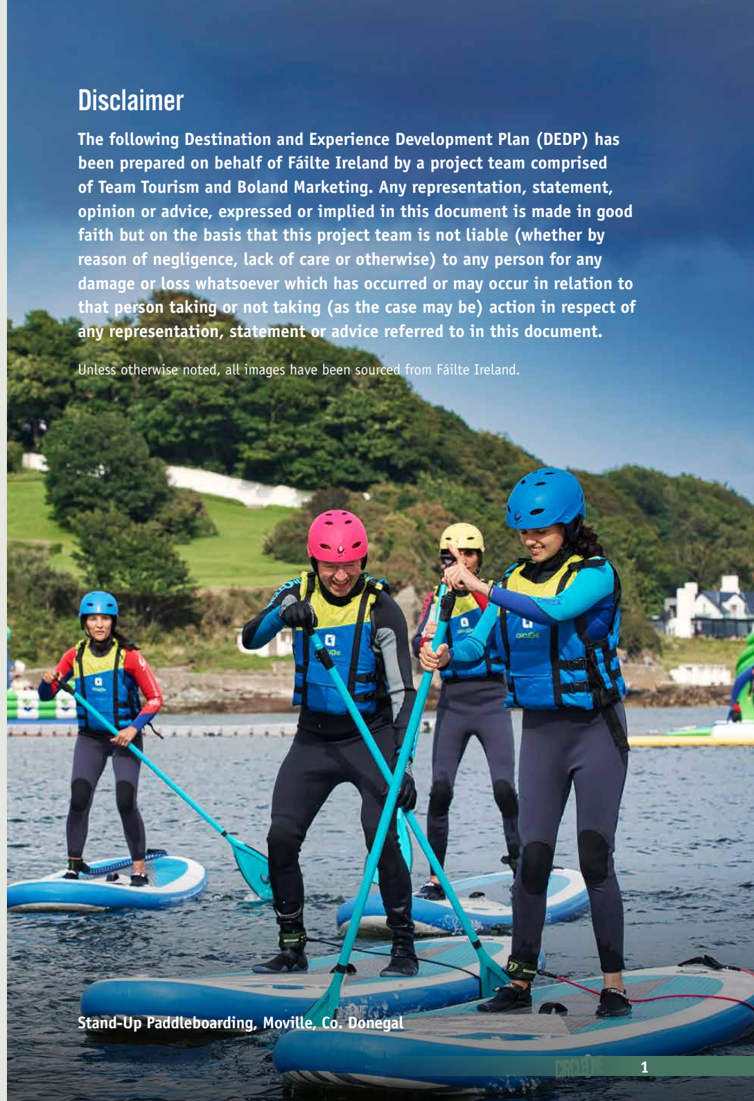
Stand-Up Paddleboarding, Moville, Co. Donegal