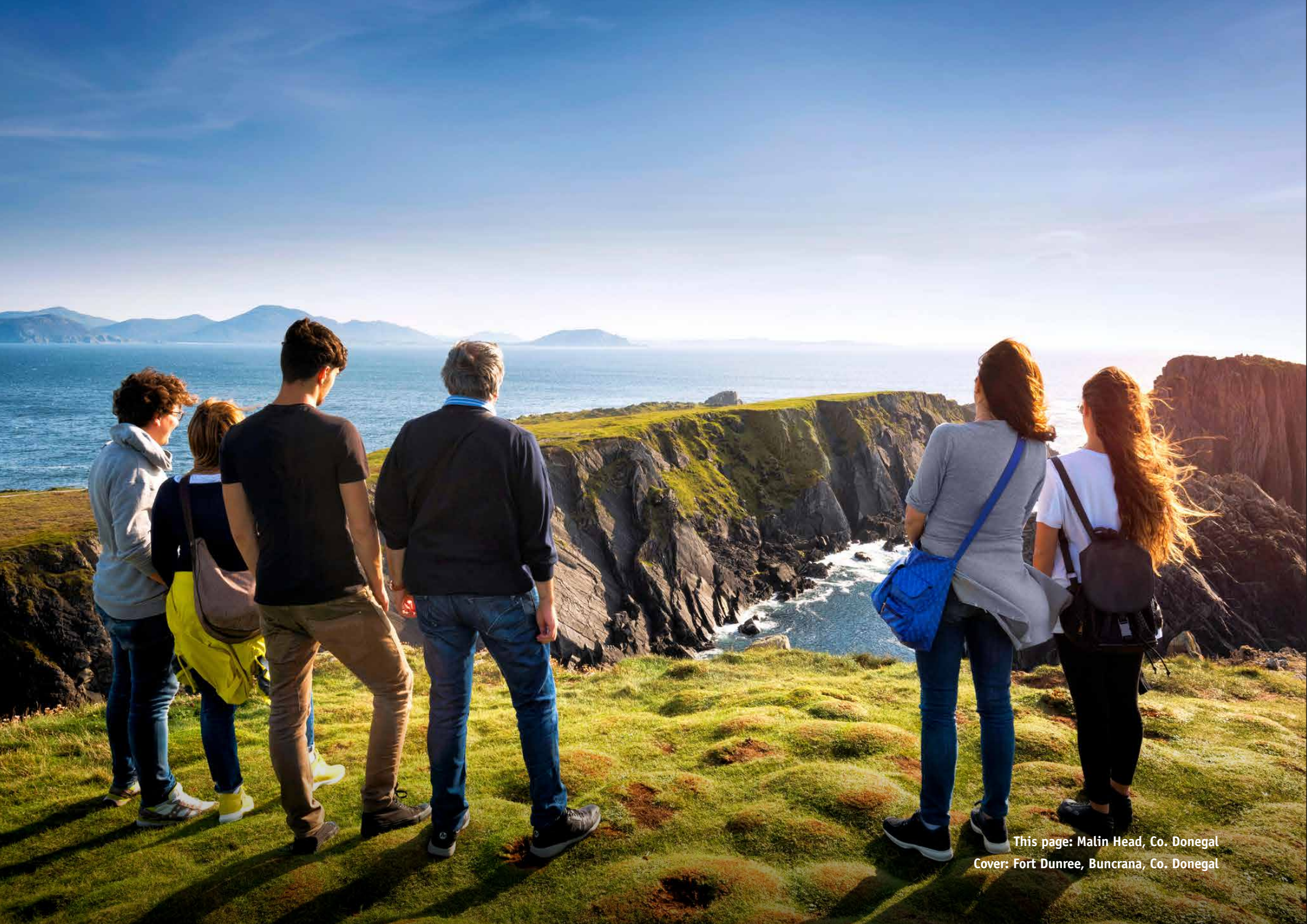
This page: Malin Head, Co. Donegal Cover: Fort Dunree, Buncrana, Co. Donegal