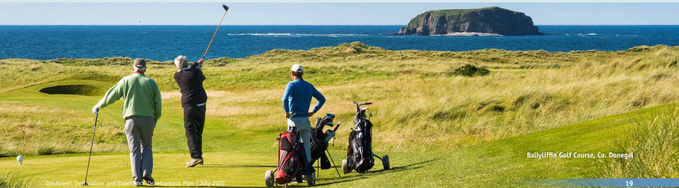
Ballyliffin Golf Course, Co. Donegal

Whether today’s visitor is looking for elemental wildness or peace and serenity, both can be readily found on the Inishowen Peninsula. Against a backdrop of natural heritage that has potential world acclaim, the visitor can pursue adrenaline-filled coastal adventure or can slow down in a landscape that promises an enhanced sense of well-being.