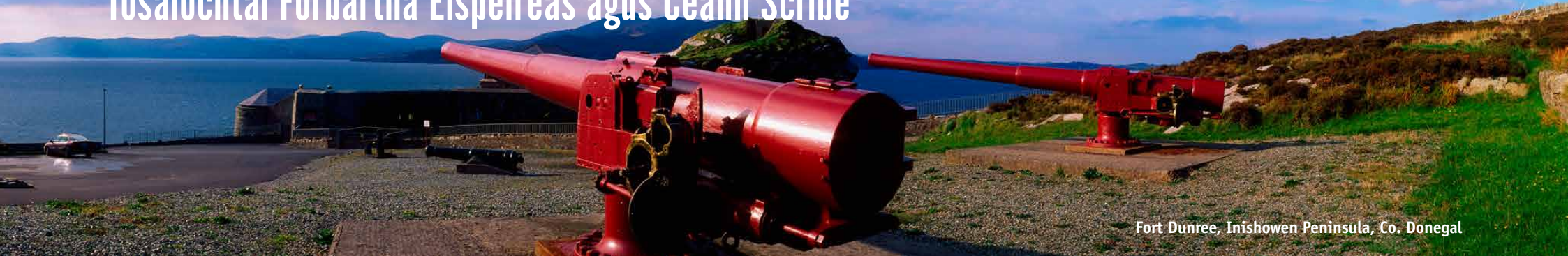
Fort Dunree, Inishowen Peninsula, Co. Donegal