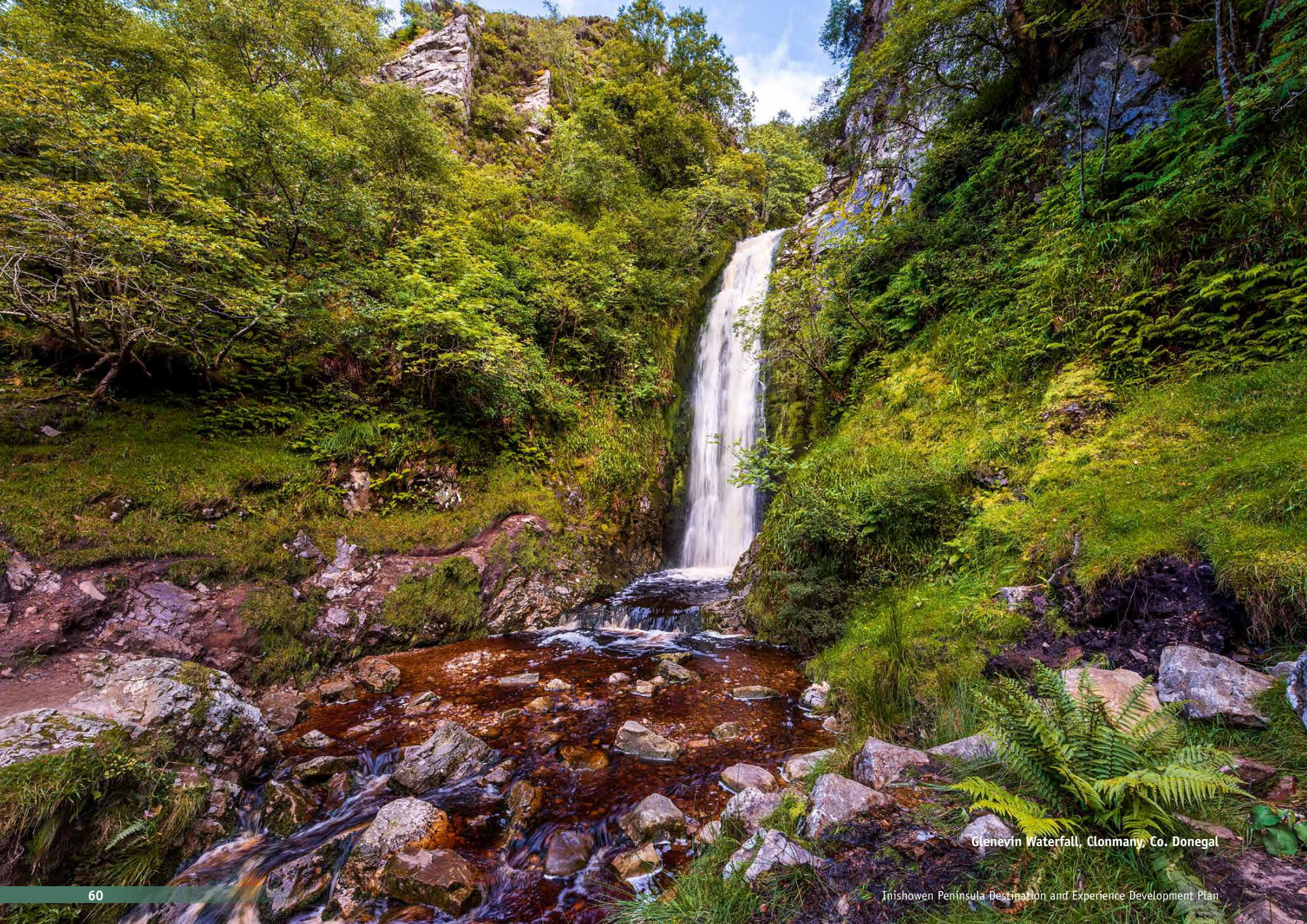
Glenevin Waterfall, Clonmany, Co. Donegal