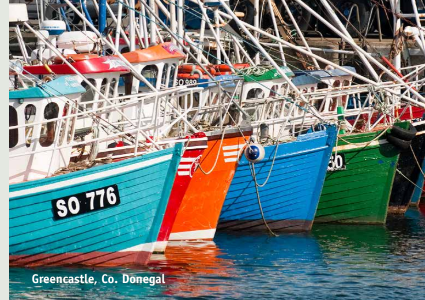
Greencastle, Co. Donegal

The eastern shores of Inishowen along Lough Foyle continue with many maritime stories of shipwrecks, smuggling, trade, and emigration. Moville was once a major port on par with Cobh in Co. Cork, with large trading ships and transatlantic liners regularly dropping anchor in its deep waters. Today, the ties with Boston, Newfoundland, and New Brunswick are still strong and much of Moville's former glory is still reflected in the architecture, but life is now much quieter and trade across the ocean has ceased. The ties to the sea are now stronger in Greencastle with its commercial fishing port and ferry service to Magilligan. A trail linking the two towns gives visitors the opportunity to explore the Foyle coastline by foot. Muff marks the start/finish of the Wild Atlantic Way and will shortly be connected to Derry-Londonderry by the North West Greenway Network.