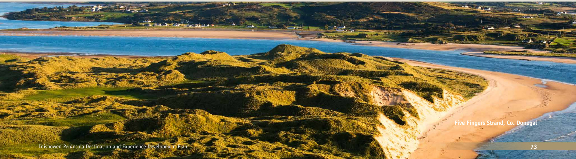
Five Fingers Strand, Co. Donegal

Where possible, extension of existing greenways and future development of new greenways and blueways should complement and integrate rather than replace existing green infrastructure. Stakeholders considering the development of greenways and blueways should have regard to the Fáilte Ireland publication Greenway - Visitor Experience & Interpretation Toolkit and Connecting with Nature for Health and Wellbeing EPA Research Report 2020.