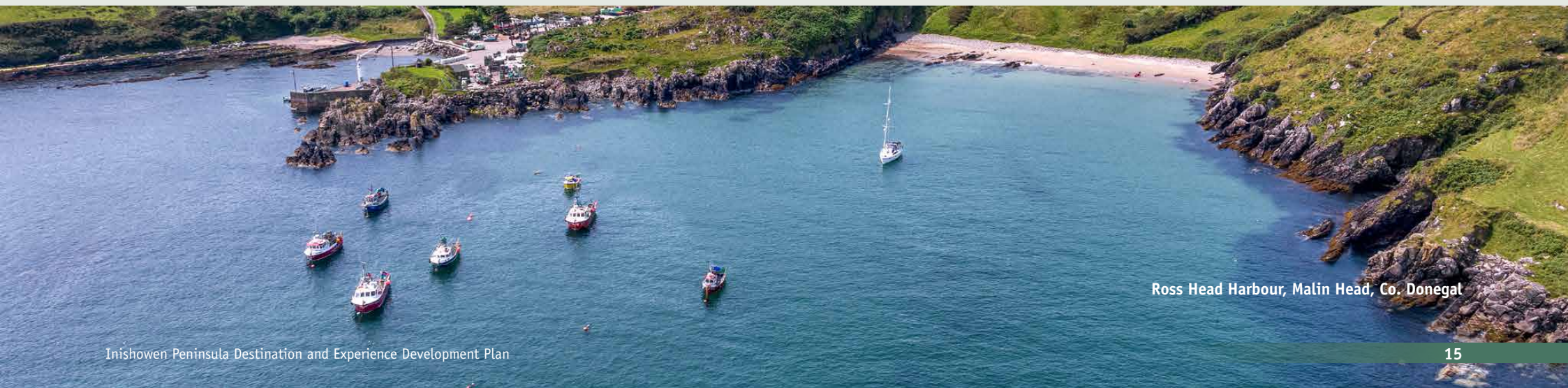
Ross Head Harbour, Malin Head, Co. Donegal

Descriptors of the Inishowen Peninsula – community sessions 2020