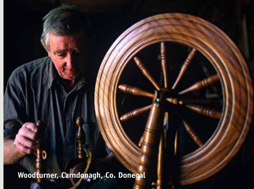
Woodturner, Carndonagh, Co. Donegal

“St. Patrick’s Bed is an historic place, and the legends claim that when the Patron Saint visited Inishowen, he came to Carndonagh and said to his followers: ‘If I sleep in peace this night, I shall build my Church on this site.’ So the night passed, St. Patrick slept peacefully and, as he promised, he built his Church” (Folklore Museum, UCD). Carndonagh and Culdaff are a treasure trove of monastic and spiritual heritage with high crosses a particular speciality. They are both sited at key gateway locations to Malin Head, with Carndonagh surrounded by hills and Slieve Sneacht to the south west and Trawbreaga Bay to the north west, and Culdaff famous for its Blue Flag beach and water-based activities. Creativity characterises the area, with art and craft studios close by and music, poetry, and singing part of its cultural legacy.