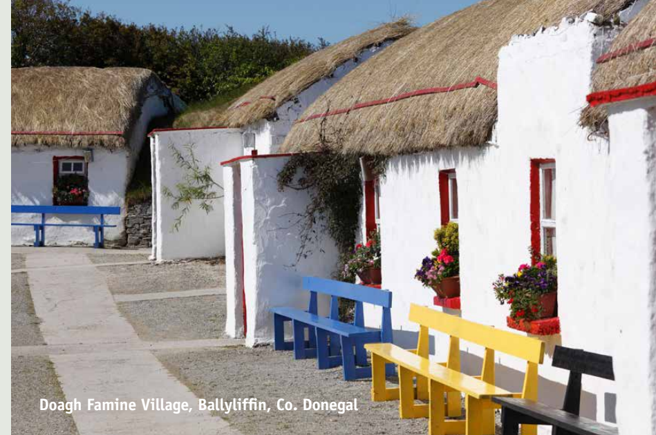
Doagh Famine Village, Ballyliffin, Co. Donegal

Approaching Clonmany through the Urris Hills and the Mamore Gap, the visitor can get a feel for the distinctive geography that allowed the area to become the centre of the illegal distillation of poitín. Today the area offers a wide range of outdoor activities and attractions – from hill walking, to swimming, surfing, horse-riding, or strolling along an array of beaches. Whether the visitor is looking for hidden waterfalls or Ballyliffin’s world renowned golf course that hosted the 2018 Dubai Duty Free Irish Open, or whether someone’s interests lie in prehistoric rock art, ancient, raised beaches, and diverse wildlife – these experiences can all be found in this part of the peninsula. Arts, crafts, festivals and agricultural shows all tie the contemporary to the past, while the opportunity to stay in a range of quality accommodation awaits at the end of the day.