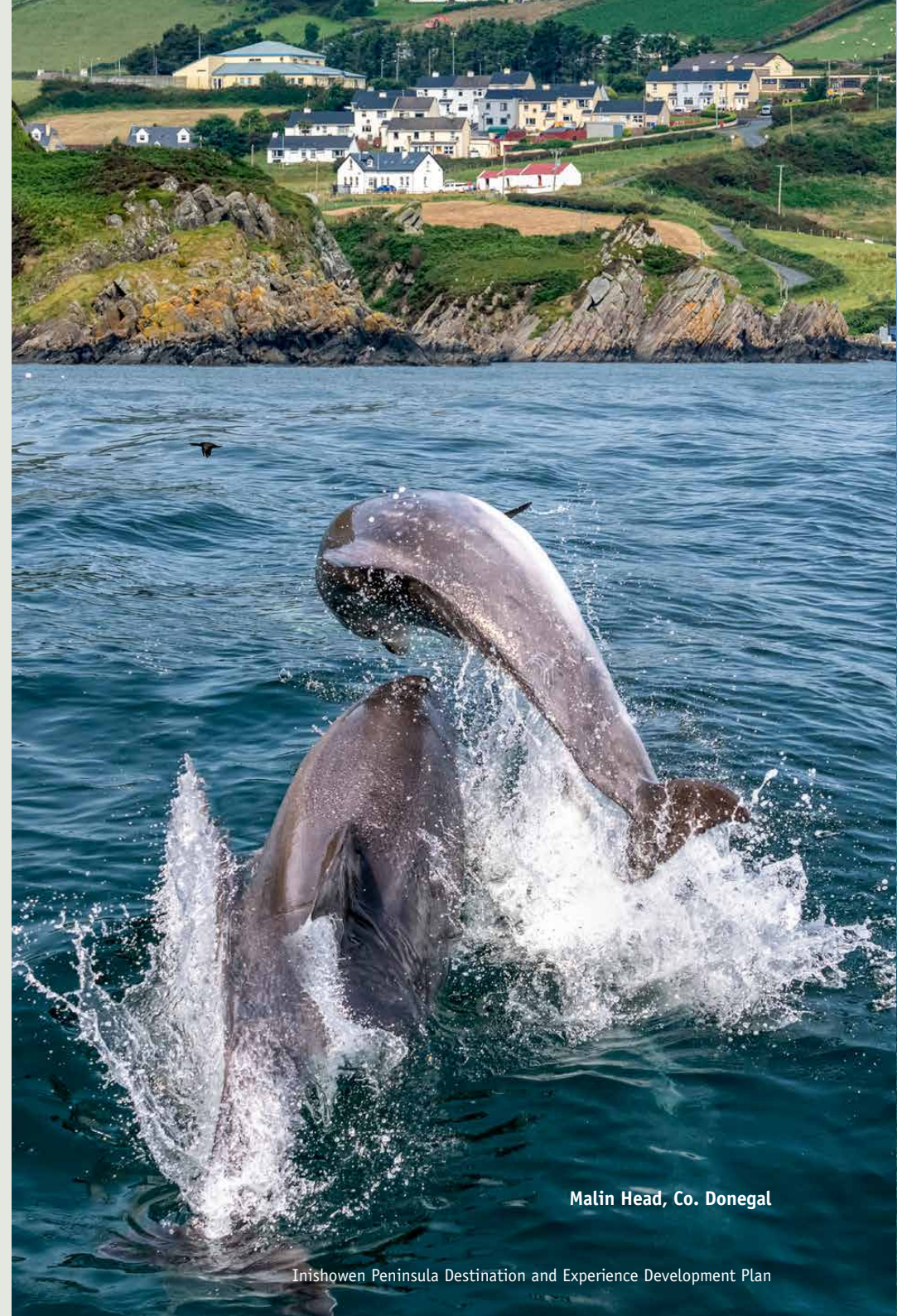
Malin Head, Co. Donegal

*As outlined in policy statements such as Programme for Government – Our Shared Future (2020) and Our Rural Future: Rural Development Policy 2021-2025 (2021).