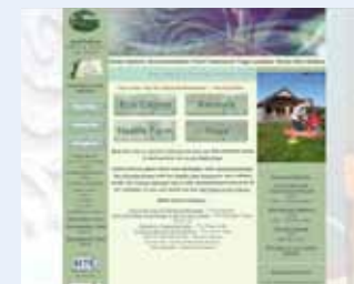
Ard Nahoo website