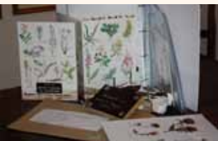
Malkin Tower Farm