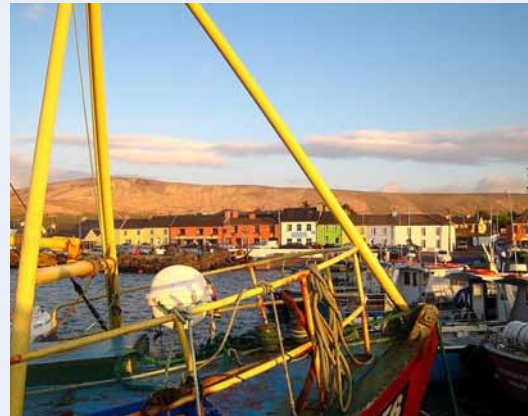
The Moorings Pub and Restaurant

The Moorings Pub and Restaurant , in Portmagee Co. Kerry, are extremely proud of their accolade of Gold in the Green Hospitality Awards. They not only engaged the national press but also the local press, to publicise the fact that they are the only Gold GHA business in Kerry. By spreading the word in local newspapers and on local radio they improved their profile locally.