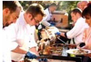
Summer BBQ at The Brooklodge Hotel

What we do: Macreddin Village has made a name as being a stalwart supporter of the producer of artisanal organic and wild foods, and could not survive without these fabulous individual food producers. The hotel has constantly worked at helping this group of food heroes: we showcase them on our menus, we showcase them in dedicated food blogs, we showcase them at our renowned monthly Macreddin village food markets, where our food heroes get to meet, directly with the public.