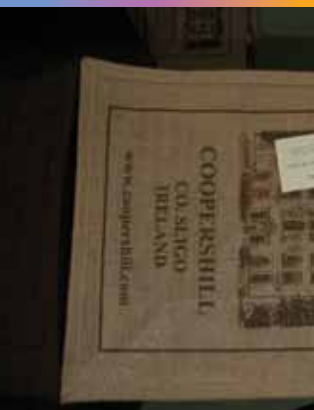
Coppershill jute bag

We have tried other campaigns such as planting a tree for €20 in our grounds, which has had a low take up and we hardly