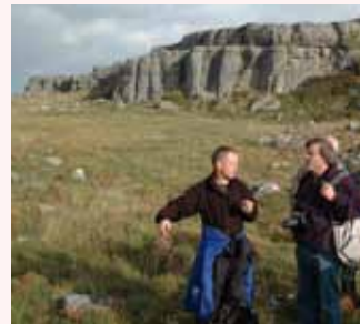
Heart Of Burren walks

Airfield (Dundrum, Co. Dublin), a 35 acre working farm and formal gardens, recently introduced Sustainable Saturdays - this is a once monthly day of learning to grow your own food, or reusing items through swapping and a vintage and craft market. This gets people to engage simply in being green.