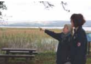
Leitrim Landscapes Walks

Ok, you want more customers - but before you get there, remember there are many other more realistic ways of using the green message in your communications.