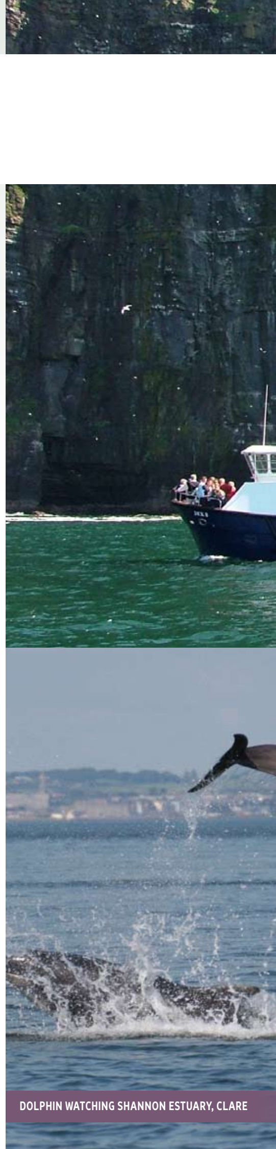
DOLPHIN WATCHING SHANNON ESTUARY, CLARE

There are around 160 bottlenose dolphins living in the mouth of the Shannon River, where it joins the wild Atlantic off County Clare’s Loop Head Peninsula. You can follow the road from Kilrush to Aylevarro Point, to see them playing just offshore. Or, for close-up views, you can take a Dolphinwatch boat trip from Carrigaholt, to see dolphins – and hear hydrophone recordings of them too. Geoff, skipper of the custom-built dolphin-watching boat the Craíocht, will introduce you to them: he’s familiar with many of the individual adults, which can be distinguished by their dorsal fin marks. Dolphin calves are born every year and you may also spot grey seals, wild mountain goats and thousands of seabirds on the colossal cliffs. The Mouth of the Shannon is an EU Special Area of Conservation, and Loop Head was designated Ireland’s Aquatic Destination of Excellence, 2010.