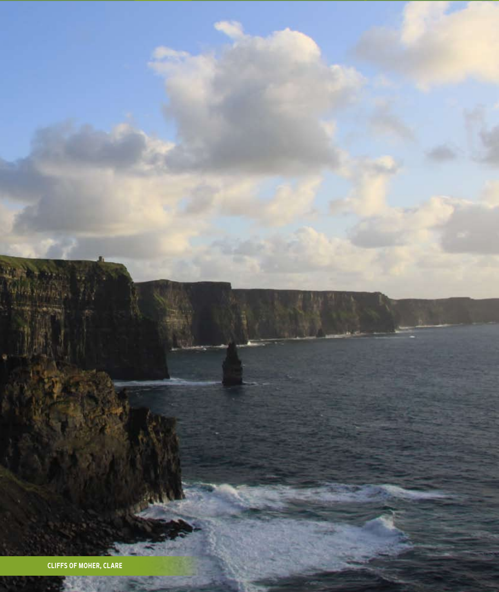
CLIFFS OF MOHER, CLARE

WHEREVER YOU GO ALONG THE WILD ATLANTIC WAY, YOU WILL ENCOUNTER MOMENTS OF MAGIC, MOMENTS TO TREASURE AND EXPERIENCES THAT YOU WILL WANT TO RETURN TO AGAIN AND AGAIN.