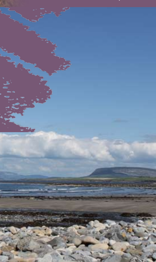
AUGHRIS HEAD, SLIGO