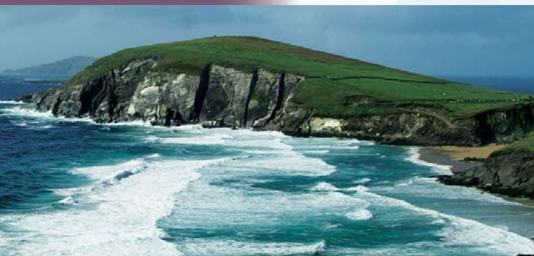
VIEW OF COUMENOLE BEACH