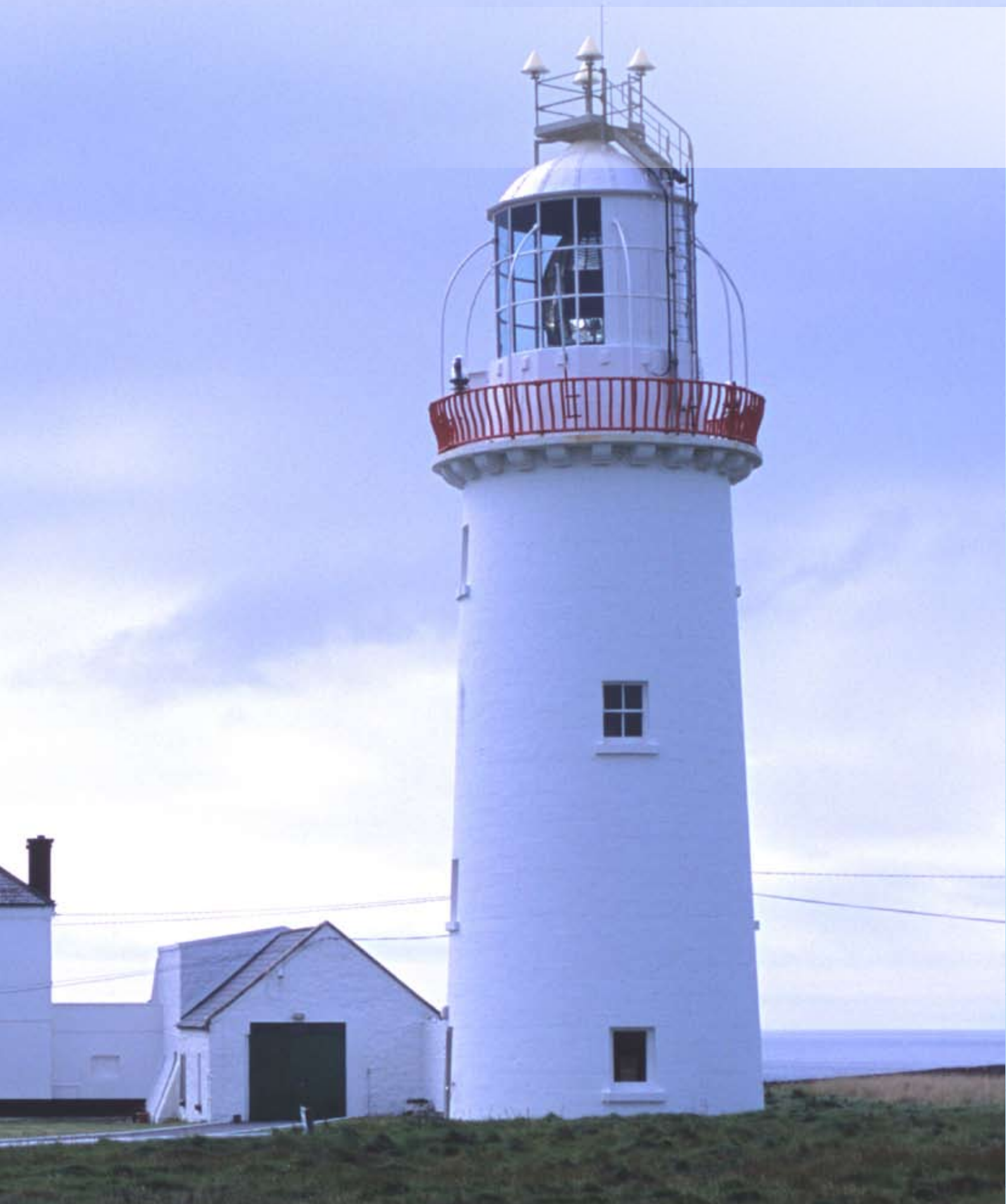
LOOP HEAD LIGHTHOUSE, CLARE