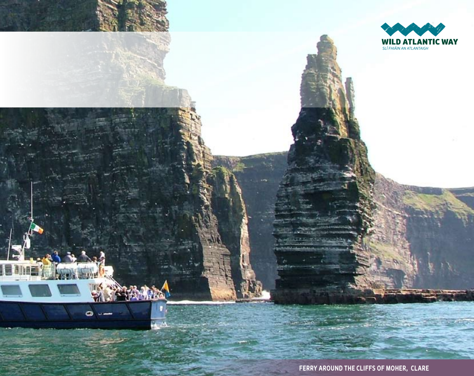
FERRY AROUND THE CLIFFS OF MOHER, CLARE