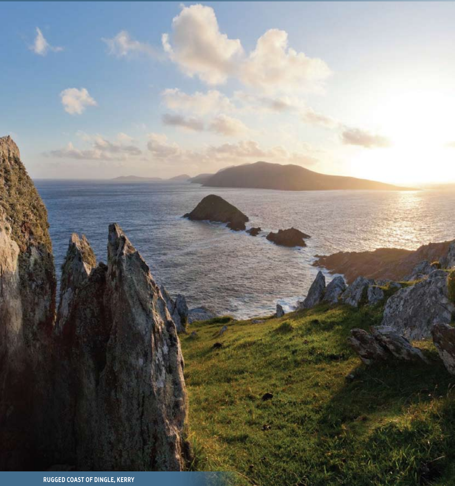
RUGGED COAST OF DINGLE, KERRY