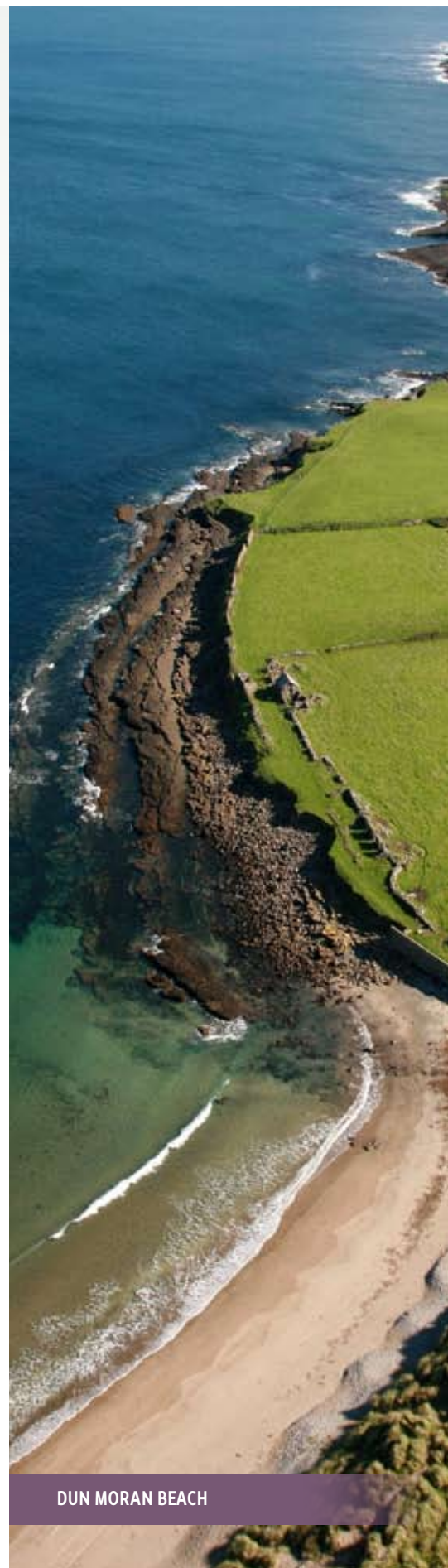
DUN MORAN BEACH