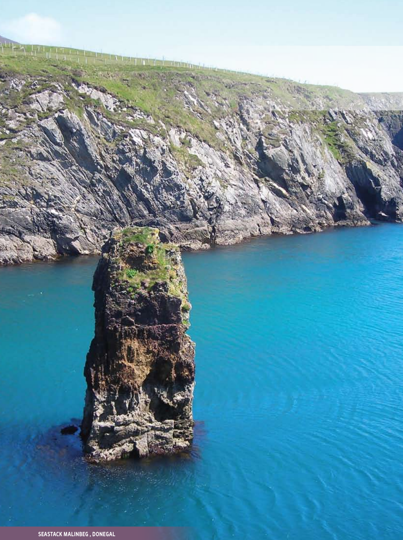
SEASTACK MALINBEG , DONEGAL