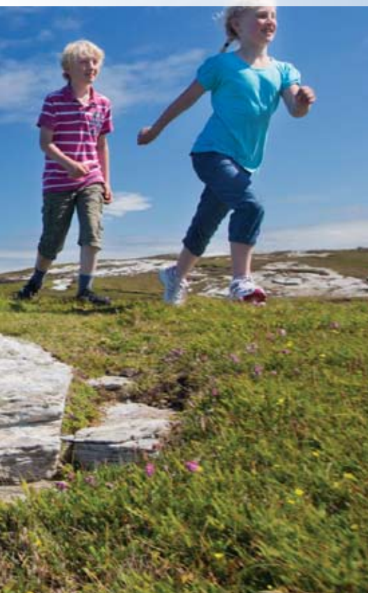
MALIN HEAD, DONEGAL