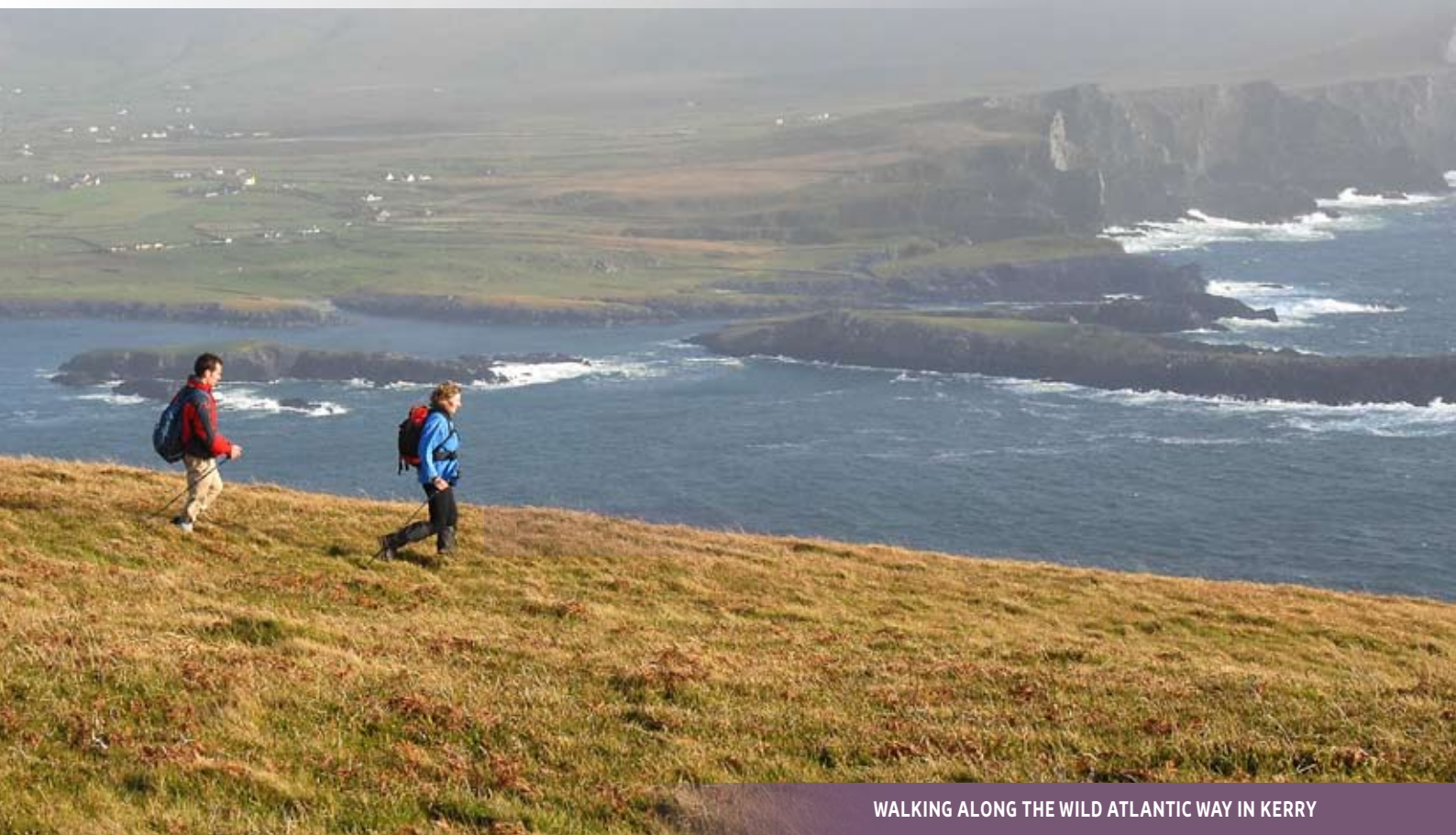
WALKING ALONG THE WILD ATLANTIC WAY IN KERRY