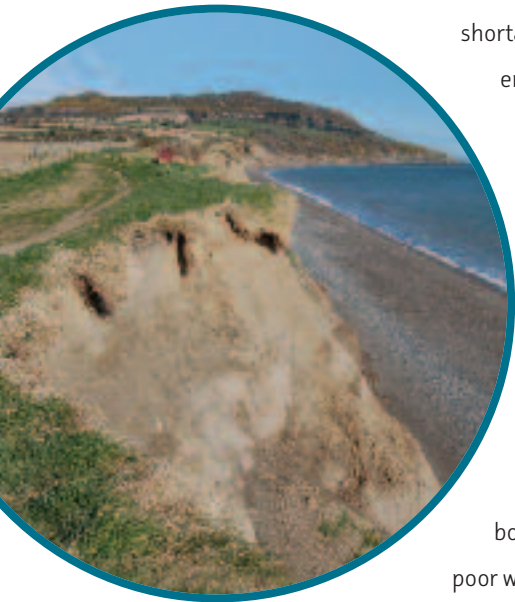
Erosion of the cliffs north of Greystones. The location of coastal paths must be considered carefully in the light of increasing rates of coastal erosion.

However, it's not all bad news for tourism. For example, climate change can bring with it a number of opportunities which operators can capitalise upon, and others which we may not even be able to foresee at this time. A case in point is nature-based tourism, which is likely to see both positive and negative impacts from climate change.