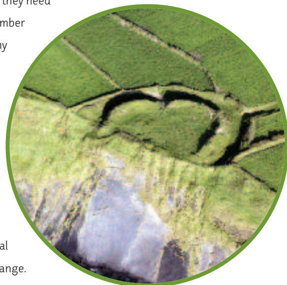
Doon West ringfort in Co Kerry offers a very spectacular example of coastal erosion.

Effective conservation of the built heritage requires greater levels of inspection,