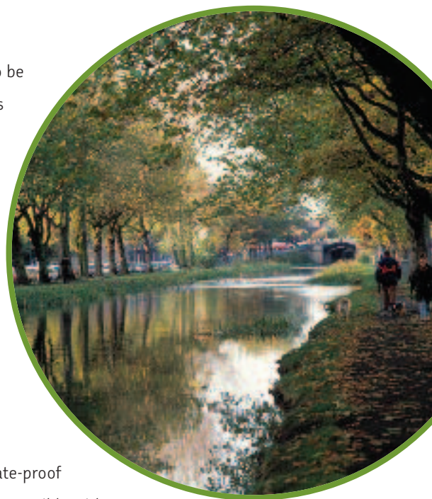
Grand Canal, Dublin. With a greater frequency of extreme rain events, and prolonged drought periods, the management of water levels on the canals and inland waterways will become more complex and important.

The costs, financial and otherwise, of protecting our heritage and tourism resources need to be placed against the feasibility of undertaking this work. Priorities will have to be identified and trade-offs made on what to protect and conserve, and what to let go, based on high quality information on the significance of the heritage resource, alongside the values that each holds for the community.