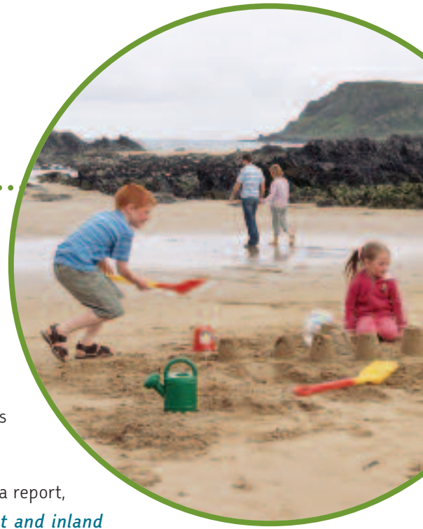
Some of Ireland's much visited beaches may disappear as sea levels rise.

The main report should be consulted for further details on all the issues covered in this summary document.