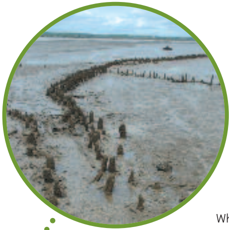
Late medieval fishtrap on the Shannon Estuary. Sites such as these will be very vulnerable to rises in sea level and the change in sediment movement.