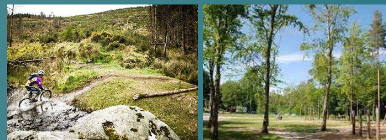
Ballyhoura Mountain Bike Park Visitor Centre