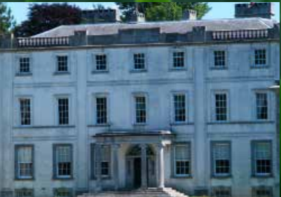
Strokestown Park Irish National Famine Museum