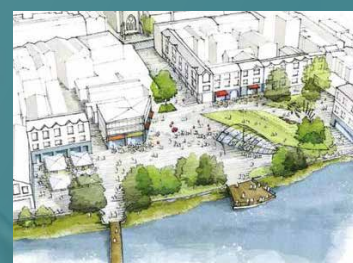
Sligo Cultural Plaza