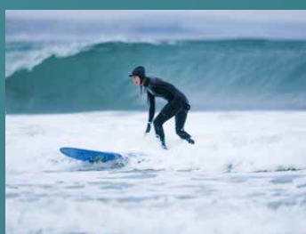
Strandhill Surfing Centre of Excellence