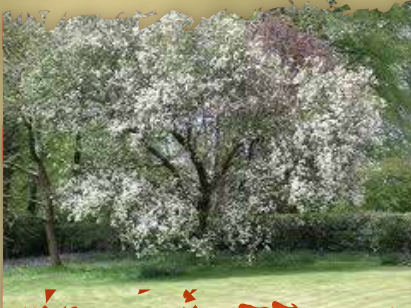
Celtic Tree Experience