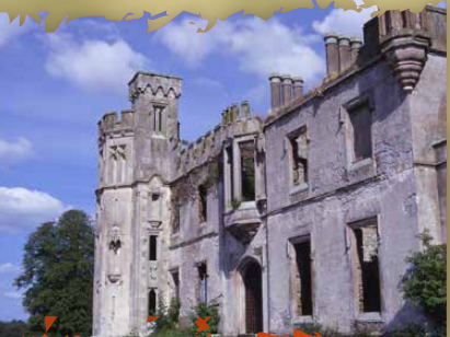
Interpretation of Duckett's Grove Historic House and Garden