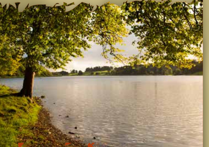
Glaslough Heritage & Audio Trail