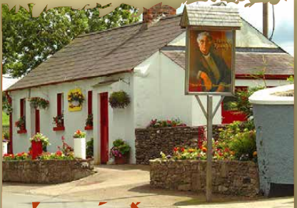
Patrick Kavanagh Visitor Centre Experience