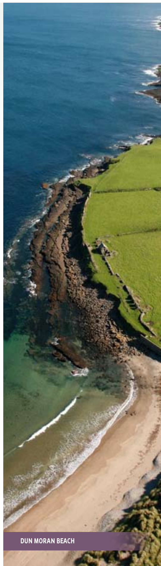
DUN MORAN BEACH