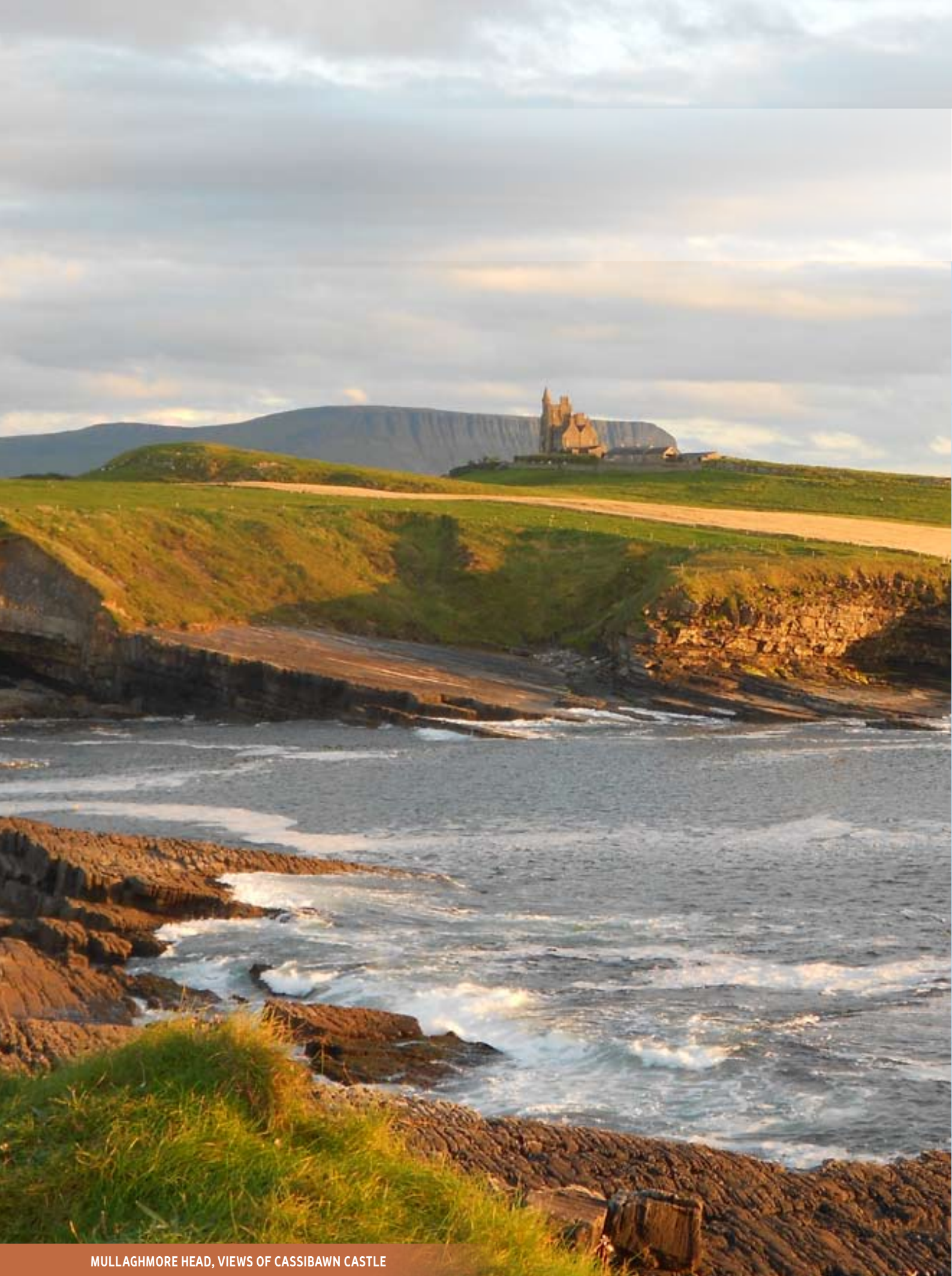
MULLAGHMORE HEAD, VIEWS OF CASSIBAWN CASTLE