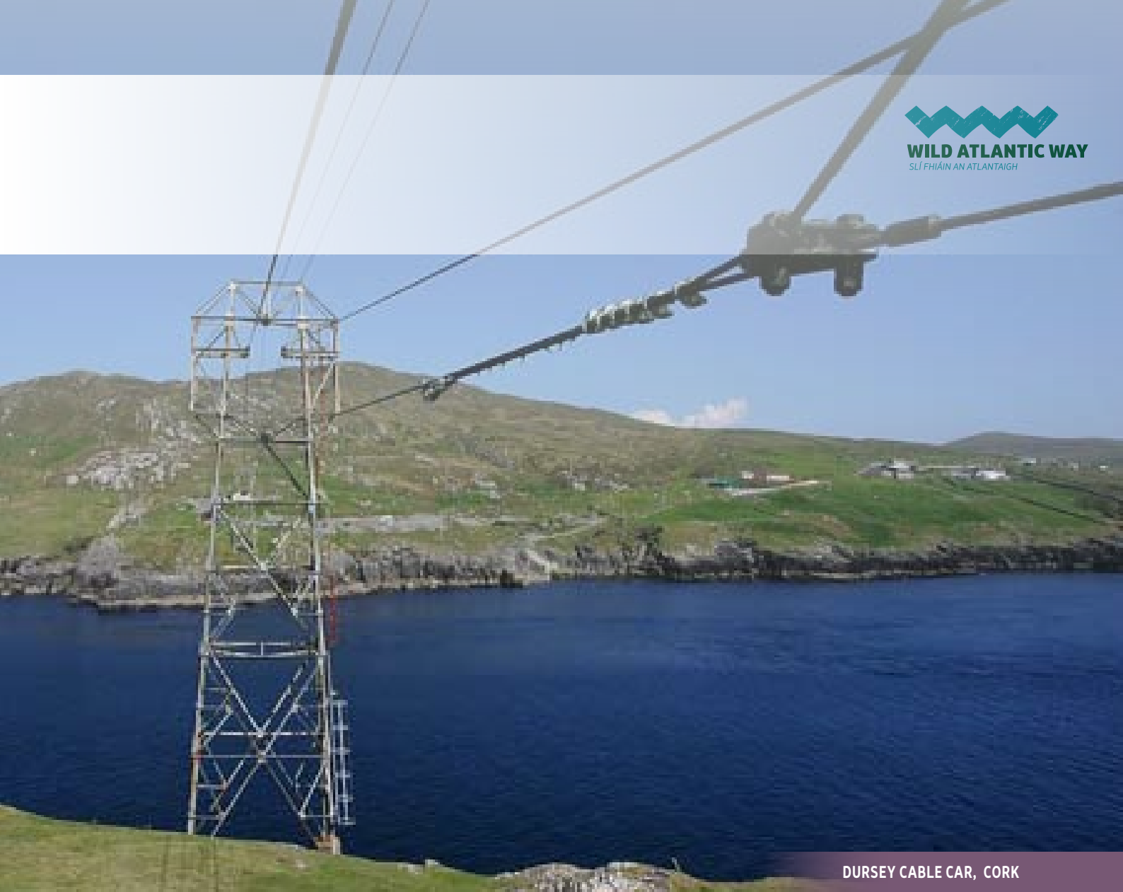
DURSEY CABLE CAR, CORK