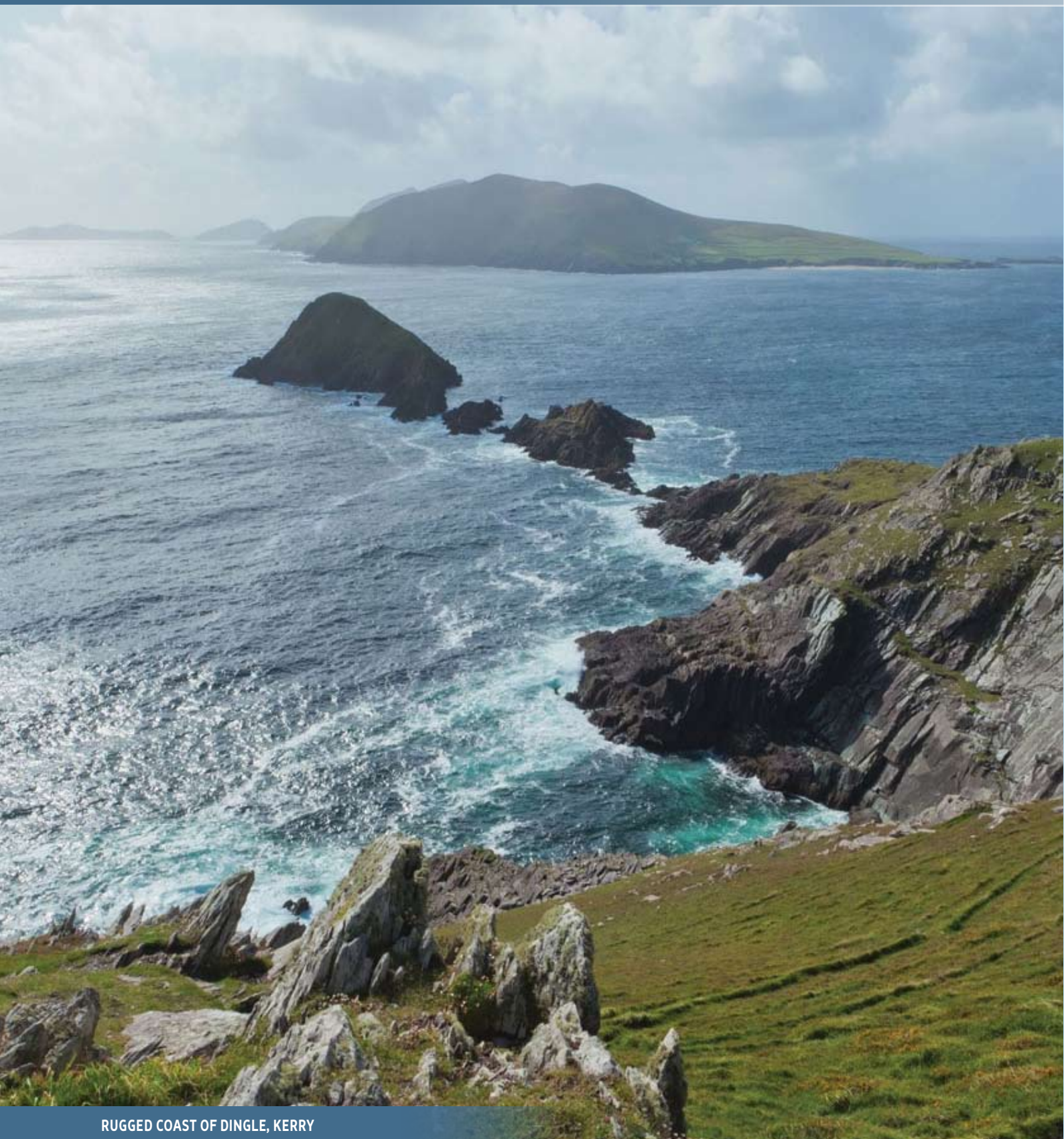
RUGGED COAST OF DINGLE, KERRY