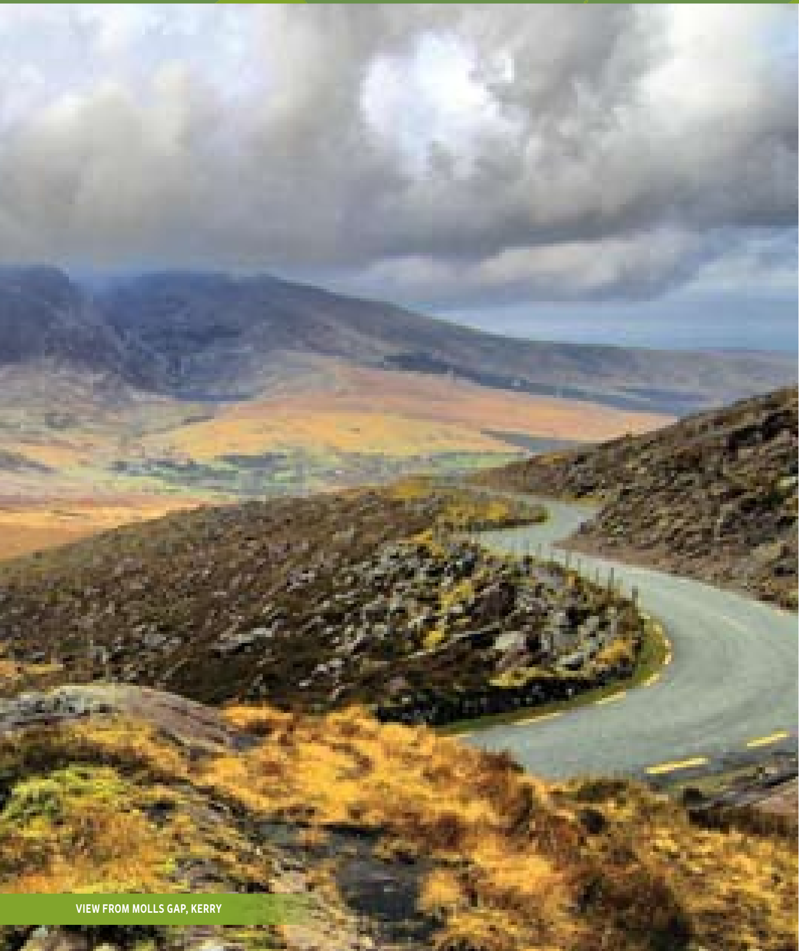
VIEW FROM MOLLS GAP, KERRY

WHEREVER YOU GO ALONG THE WILD ATLANTIC WAY, YOU WILL ENCOUNTER MOMENTS OF MAGIC, MOMENTS TO TREASURE AND EXPERIENCES THAT YOU WILL WANT TO RETURN TO AGAIN AND AGAIN.