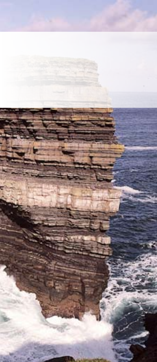
DUN BRISTE AT DOWNPATRICK HEAD, MAYO