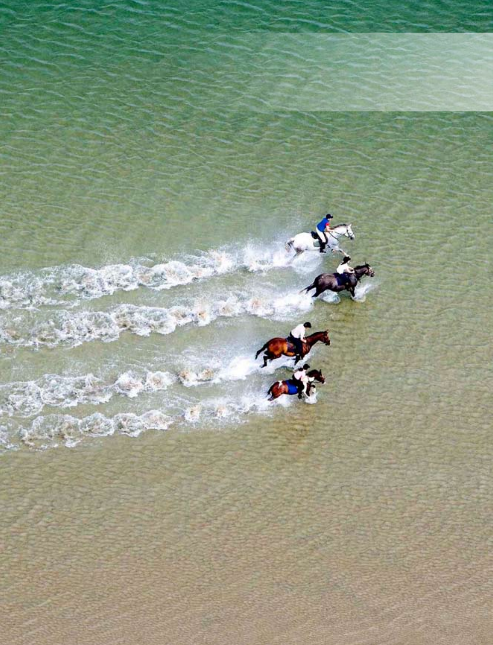
AERIAL VIEW OF BEACH RIDING ON BERTRA BEACH, MAYO