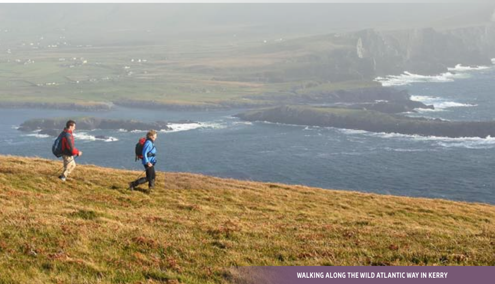
WALKING ALONG THE WILD ATLANTIC WAY IN KERRY