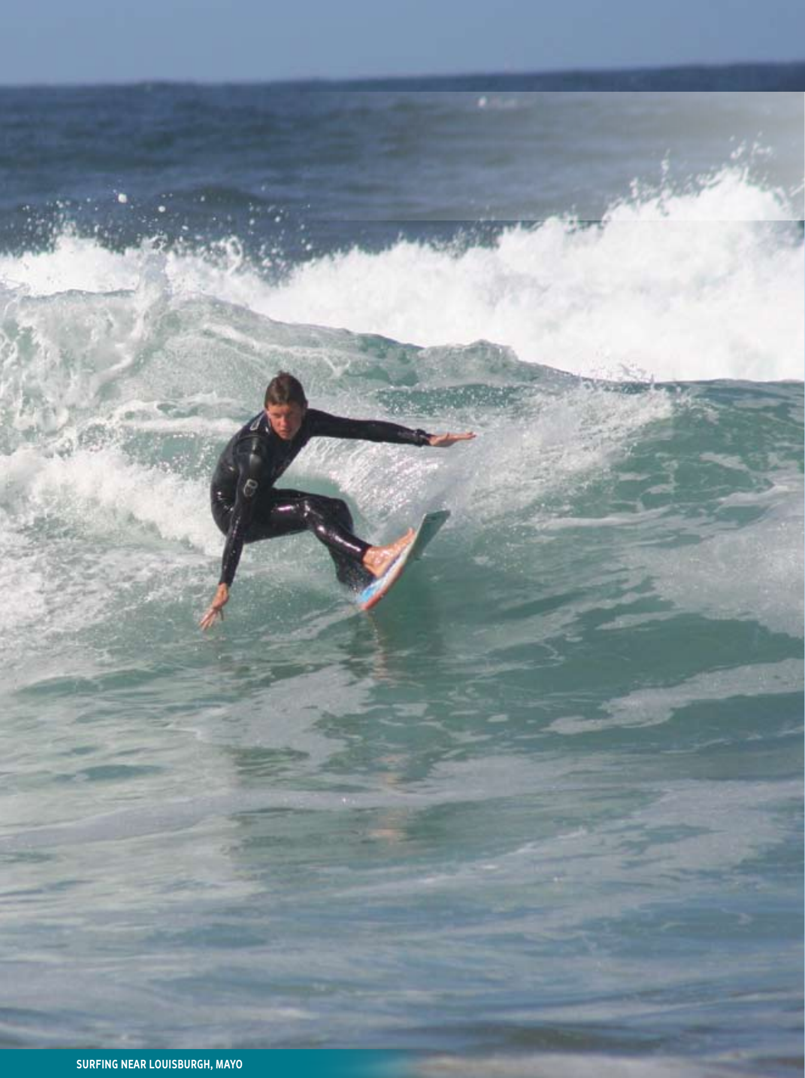
SURFING NEAR LOUISBURGH, MAYO