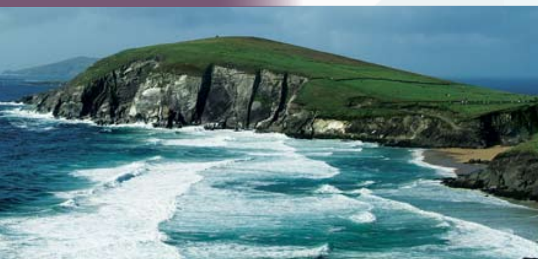
VIEW OF COUMENOLE BEACH