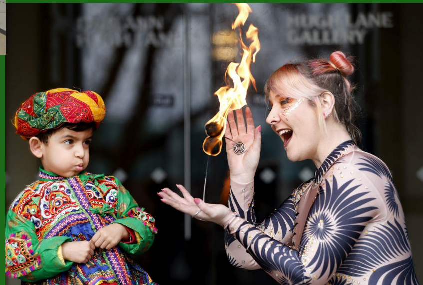
St. Patrick's Festival 2025 Launch Video