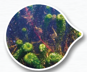
African Curly Waterweed